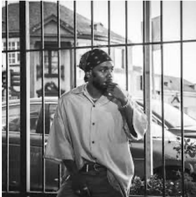
A More Appropriate Forum...