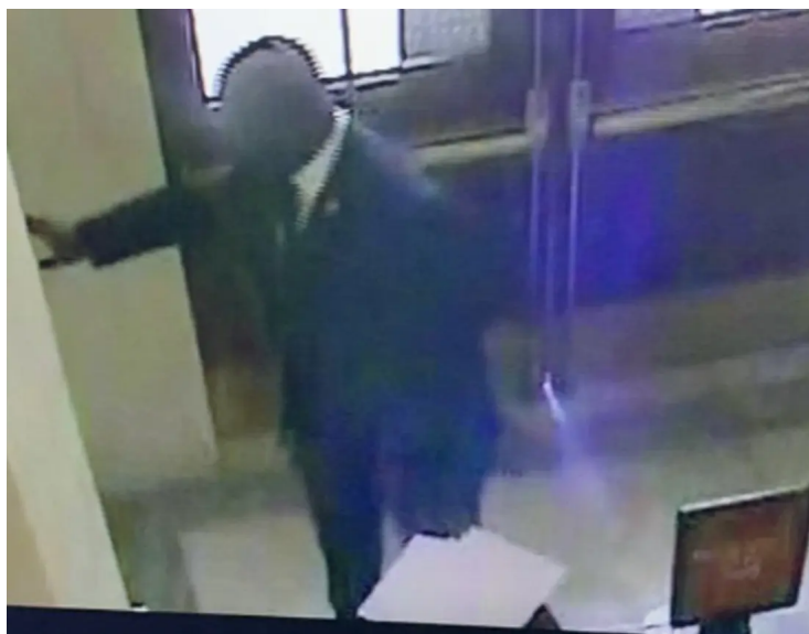
Bowman Activating Fire Alarm

"The reason why heart disease and cancer and obesity and diabetes are bigger (sic) in the black community is because of the stress we carry from having to deal with being called the N-word directly or indirectly every day."