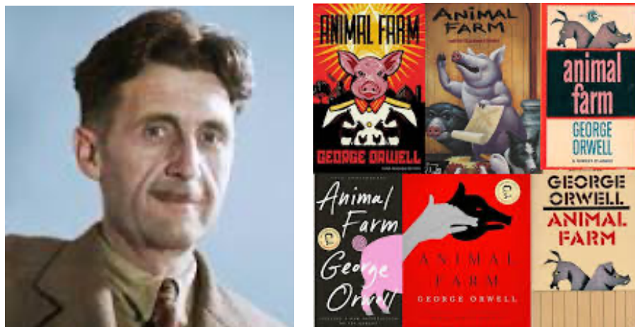
George Orwell and Various Editions of Animal Farm

Infantilism among the left is clearly promoted by the very ideology of Marxism -- to which all leftists subscribe -- whether they care to acknowledge this fact or not. Its dogma dictates that there is no such thing as objective “ truth ,” and that truth is defined as anything that furthers the socialist revolution they advocate and promote. Thus, lying and deceiving are perfectly acceptable. It was probably this phenomenon that inspired George Orwell's Animal Farm .