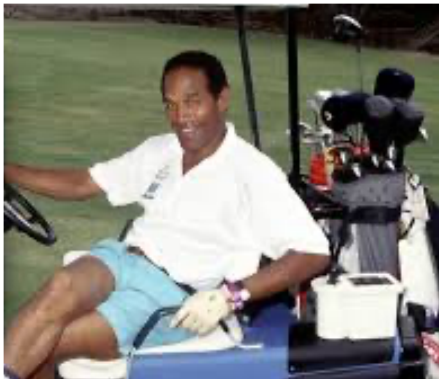
O.J. Simpson Searching for the "True" Killers