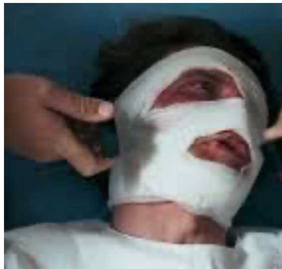
Harry Callahan & " Scorpio " with Self-Inflicted Injuries

As outrageous as Smollett's fake hate crime was, equally outrageous were the corrupt and arbitrary actions of the injustice system prevailing in Cook County, as well as the state's thoroughly politicized and corrupt