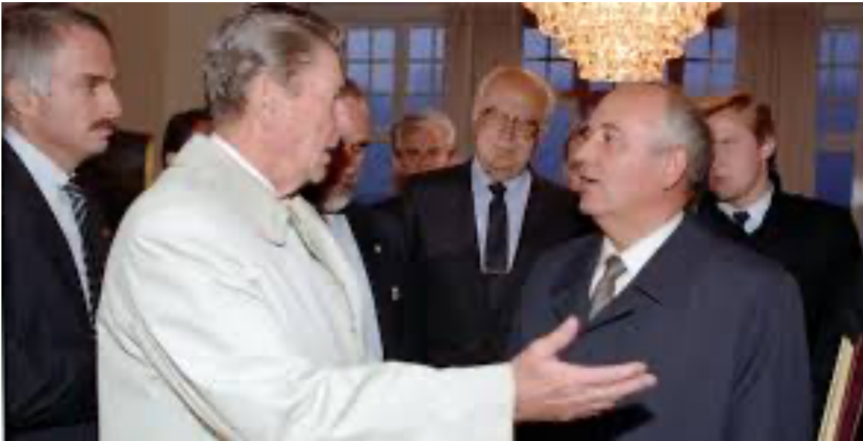
The Gipper Straightening Out Gorbachev

"...the room was full of similar knots of people, Americans leaning forward and jabbing the air, and Soviets leaning (backwards,) looking surprised. This wasn't what they got when they met with Carter's people. This wasn't what they got when they met with Ford. They were surprised by conviction. It has been a long time since they have seen Americans like this..."