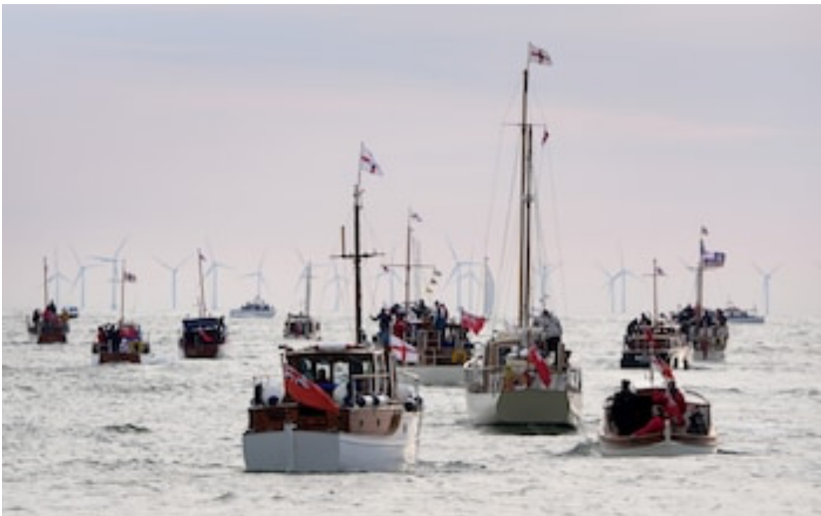
2025 Reenactment of Operation Dynamo

Like many European nations seemingly intent on suicide, France's leaders are more enamored of migrants from Africa and the Middle East than truffles and Champagne. When the flotilla commemorating Operation Dynamo began to approach French waters, the Border Force and French Navy demanded that the British flotilla slow its advance in order to allow a boat filled with 80 migrants to continue its voyage from France to England. The flotilla was ordered to keep a full nautical mile distance from the migrant boat as it was being escorted across the Channel to England.