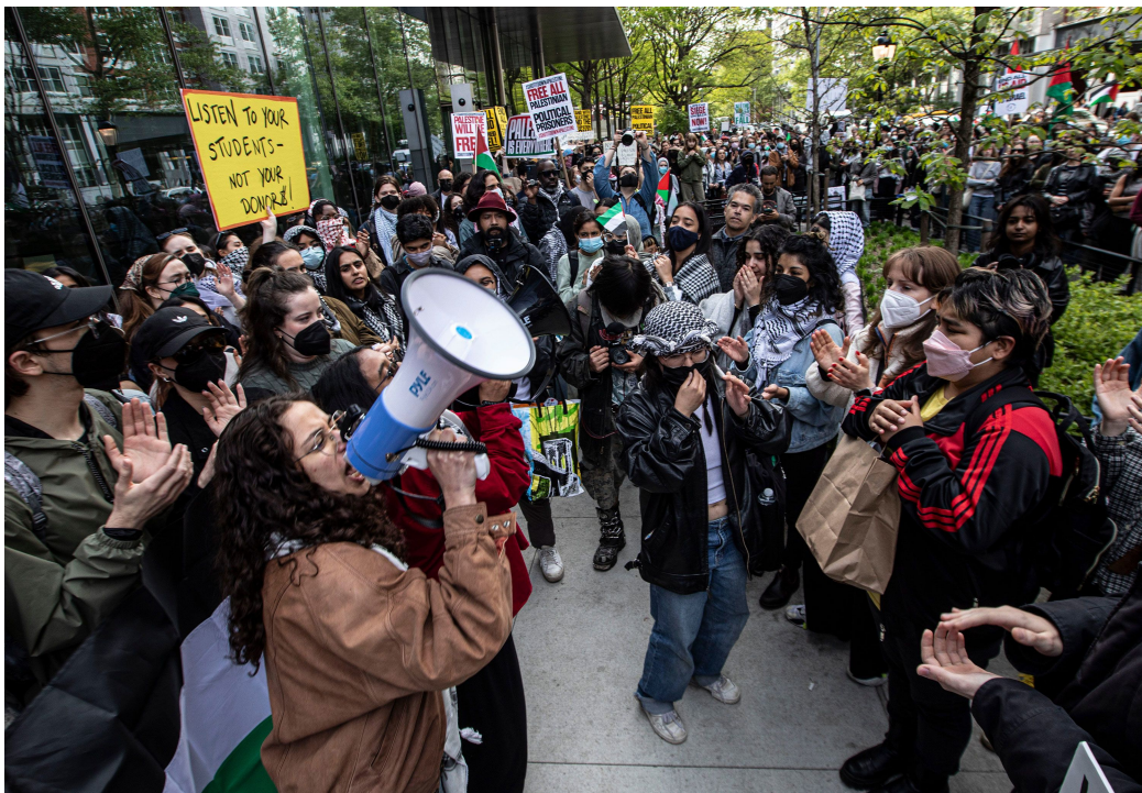
Pro-Hamas, Anti-Israel Demonstrators

Other Stepford Children are pro-Hamas, anti-Israel demonstrators who have shut down American universities over the past year. Their ostensible purpose is to protest Israel's retaliatory strikes against Hamas following the latter's massacre of 1,200 innocent Israeli citizens in October of 2023. Most student demonstrators are dilletantes, so when questioned by the news media, few could offer a coherent explanation for the reason they were demonstrating. Many are too ignorant and doltish to recognize they've been misled by professional agitators, who fund and organize their pro-genocide activities against Israel.