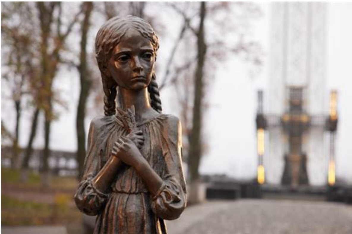
Memorial to Victims of "The Holodomor"