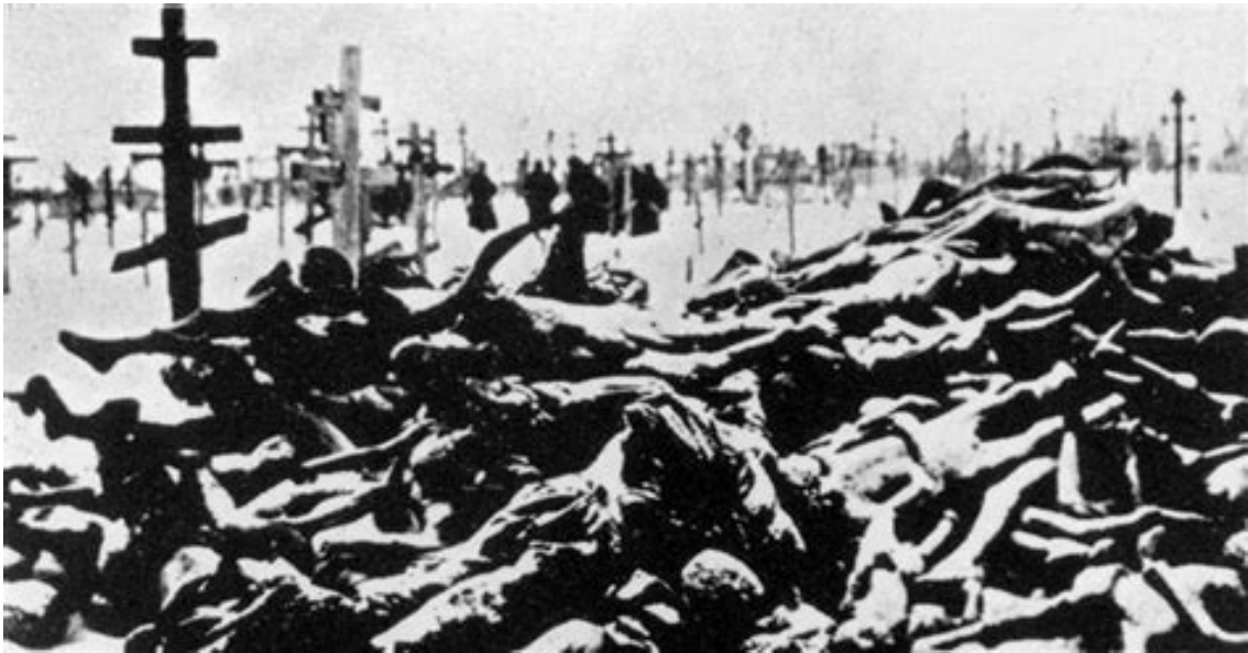
Stacked Bodies of Victims of the Holodomor .

When Stalin learned of this, he sent a message to everyone else in the Soviet Union demonstrating exactly what would happen to those who resisted his authority. In Ukraine, that message was to confiscate the entire agricultural output of Ukraine's kulaks, which left them to starve to death. In fact, an estimated seven million kulaks starved to death during the winter of 1932-1933. For Ukrainians, that will remain a wound that never heals. In Ukraine, it is referred to as the Holodomor , which translates as " death by starvation ."