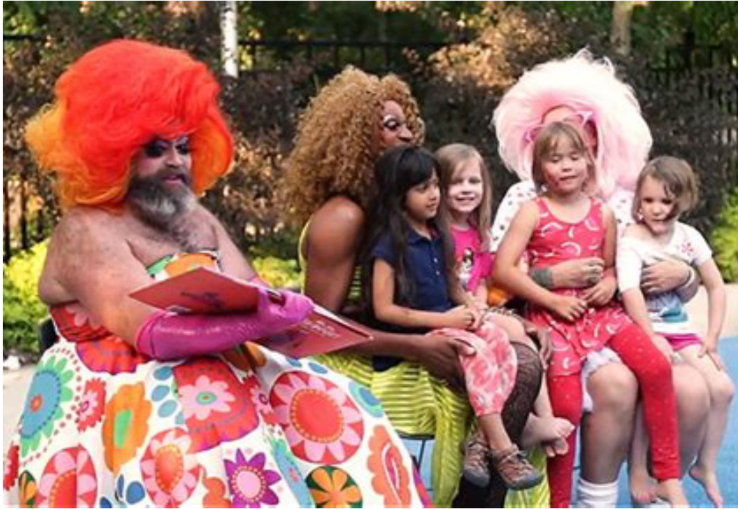
Gender Counselors Sure DO Love Kids

"wrong" gender. Once again, the NCPUSA showed greater affinity for the pederasts and circus freaks who masquerade as gender counselors , than for parents or grade school kids, themselves.