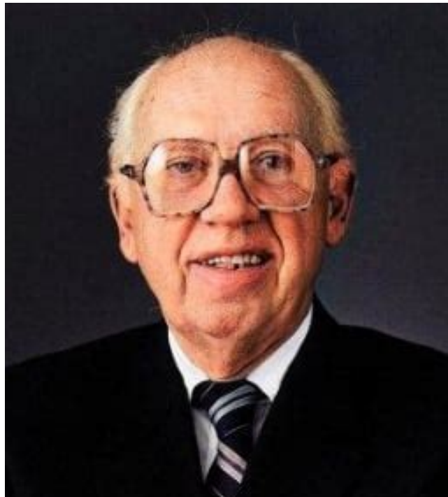
Reagan's CIA Director Bill Casey