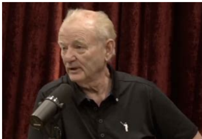
Bill Murray on Joe Rogan's Podcast

"I read like five pages of Wired , and I went 'Oh my God, they framed Nixon.' Like, all of a sudden I went, 'Oh my God, if this is what he writes about my friend that I've known half of my adult life -- which is completely inaccurate -- what the hell could they have done to Nixon?'"