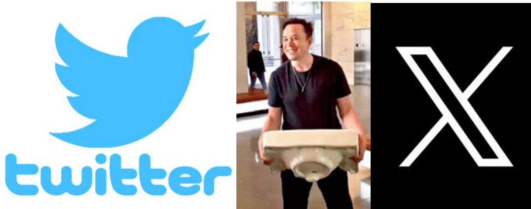
Twitter, Elon Musk and "X"

disinformation. It is now owned by someone who aggressively defends free speech, and someone who not only talks-the-talk , but walks-the-walk , as well. Under its former ownership, Twitter was coopted by the Biden Administration in an unconstitutional and criminal conspiracy to censor political opposition, even when that opposition happened to be a recognized authority on the subject at hand.