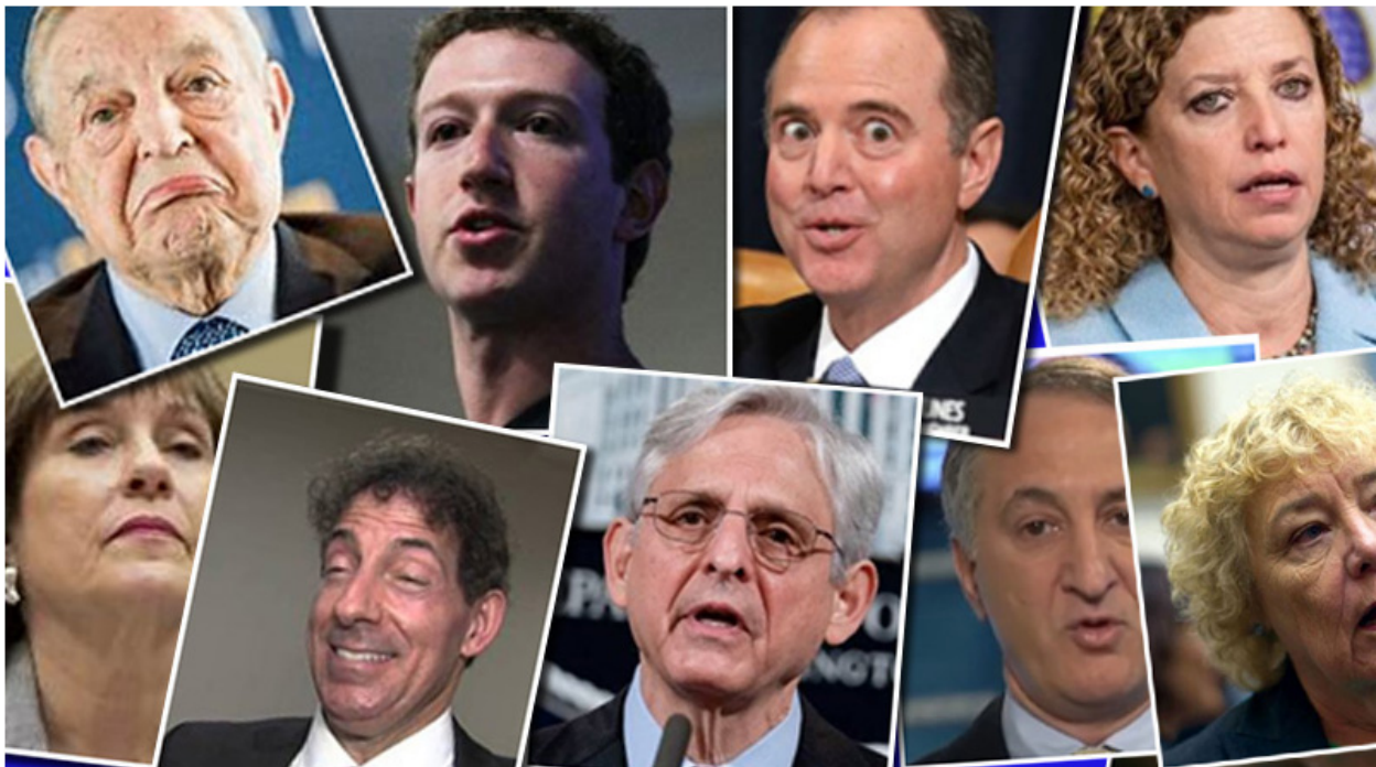
A Cabal of Treasonous Jews

unconstitutional privileges, while brazenly secularizing society by eliminating public prayer. They have also taken the lead in promoting abortion while opposing capital punishment, so only the innocent unborn face execution rather than blood-thirsty murderers. Meanwhile, they are promoters of phony " climate change ," open borders, and were the founders of feminism, " The Ladies' Auxiliary of Marxism ." Not surprisingly, they comprised the vast majority of Americans who spied FOR the Soviet Union before, during and after World War II. In 2024, 73 percent of all U.S. Jews voted for Kamala Harris, exposing their lack of judgement.