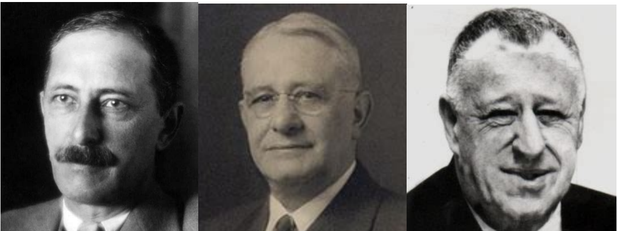
First NAACP Presidents: Joel Spingarn, Arthur Spingarn & Kivie Kaplan

Among the NAACP’s founders were William Walling, Mary White Ovington, Henry Moscowitz, Julius Rosenthal, William World, Rabbi Emil G. Hirsch, and Rabbi Stephen Wise. These were Jewish traitors who managed to accomplish the dubious feat of dramatically empowering blacks. Joel Spingarn, Arthur Spingarn, and Kivie Kaplan were the first three Presidents of the NAACP: despite being Jews, their credentials as white race-traitors made them ideal for the position. Their handiwork is on nightly display in our inner cities – once considered the “gems” of our civilization – but now synonymous with murder, gangs, welfare dependency, illegitimacy, alcoholism, drug addiction, illiteracy, venereal disease, vandalism and hopelessness.