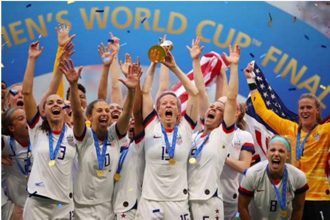
2017 U.S. Women's World Cup Championship Team

match against Russia. The boy's team beat them 5 to 2, although the talented 2017 U.S. Women's World Cup Team went on to win its coveted World Cup championship that year.