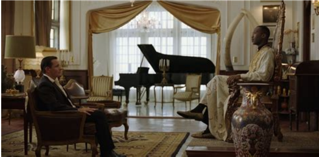
Tony Interviewing with Dr. Don Shirley

The film's title is based on The Negro Motorist Green Book , a publication that served as a guide for blacks while traveling through the Jim Crow South prior to the " Public Accommodations Laws " enacted in 1960s-era civil rights legislation. Despite his credentials and erudition, Dr. Shirley was denied access to whites-only accommodations in the Deep South, whereas Tony usually stayed in nearby whites-only hotels and motels.