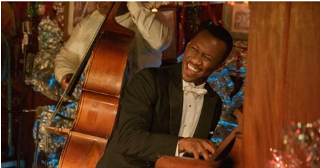
"Breaking Some Keys"

I don't want to spoil this scene for readers or viewers, but Dr. Shirley " breaks some keys " with a classical piece (Chopin, Etude Opus 25, No. 11: "Winter Wind," ) which was so impressive that even the cook came out of the kitchen to see what the hell was going on. Very much impressed by his performance, the other black musicians join Dr. Shirley , who seamlessly accompanies them in a number of improvisational jazz compositions, while doing a bit of " scatting, " himself. Pretty soon, the whole place is rocking with jazz and its energy.