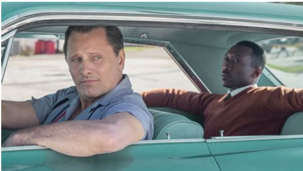
Tony Lip Driving Dr. Shirley

Several times before, Tony had asked the other members of the Don Shirley Trio why Dr. Shirley puts up with the insults and slights he endures in the Deep South. Their initial reaction was to ignore him, and stare at him as if he were a fool. At one performance, the trio's cellist, Oleg Malacovich (Dimitar Marinov,) informs him in broken English that "Dr. Shirley could have stayed up north getting rear end kissed at Park Avenue parties for three times money. But he asked for this." Oleg later reveals Dr. Shirley's true rationale for his concert tours to the Deep South. He informed Tony that in 1956, Nat King Cole was invited to perform at the Municipal Auditorium in Birmingham, where he was pulled from the stage and badly beaten by a mob of whites for playing "white man's music." Oleg then explains, "Genius is not enough. It takes courage to change people's hearts."