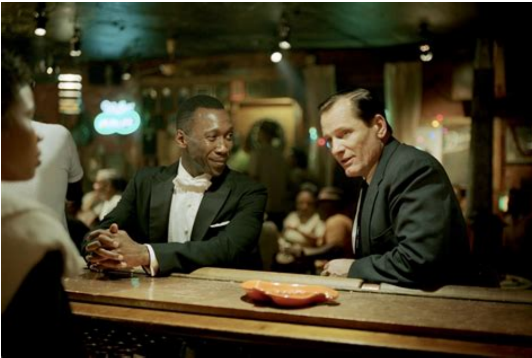
At The Orange Bird

declares that "Either I'll eat in this room, or I'm not performing tonight." Despite a blizzard of threats from the club's manager, Dr. Shirley and Tony leave the club to begin their return journey to New York. Since both are famished, they stop at a black establishment down the road from the country club called The Orange Bird . It creates quite a stir when they enter because Dr. Shirley is wearing a white-tie tuxedo with tails, and Tony is the only white guy in the place.