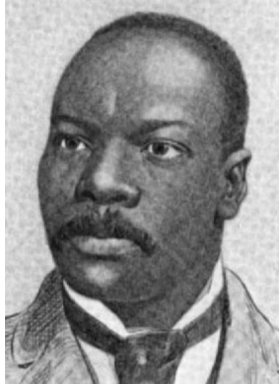
George Westinghouse and Granville Woods