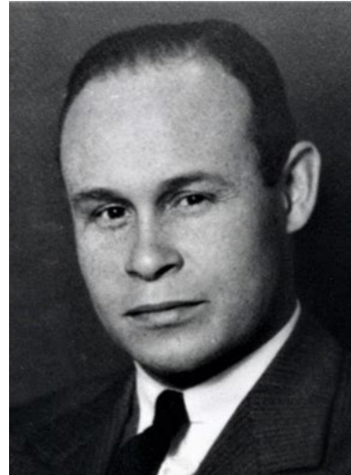
Dr. Oswald Robertson and Dr. Charles Drew

Elevator: A black man named Alexander Miles is often credited by diversity enthusiasts with inventing the elevator in 1887. This is a figment of some black " scholar's " imagination. For example, steam-powered hoisting devices were used in England as early as 1800.