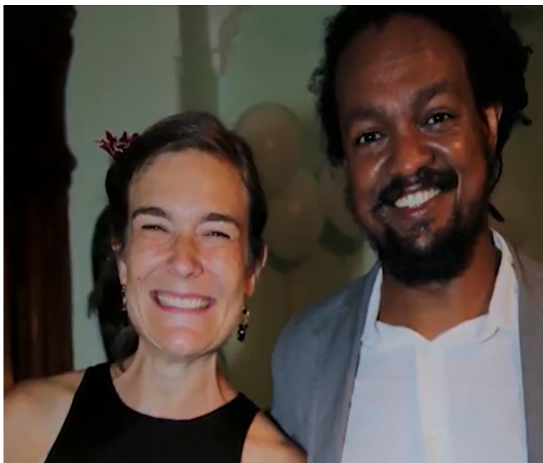
The Happy Couple

This foolish woman learned much too late about n*ggers to save her own life or that of her daughter, but there was one redeeming element to this sad incident: after murdering his wife and daughter, the rat-monkey had the decency to commit suicide by hanging his black ass.