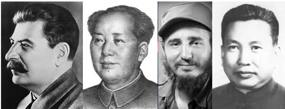
"Progressives": Stalin, Mao, Castro & Pol Pot

Progressive: A euphemism for communists not wishing to defend their ideology, which was responsible for the murder of 100 million innocent souls in the 20 th Century, alone. Their idea of “ progress ” has been realized in totalitarian socialist regimes like the Soviet Union, communist China, Cuba, Cambodia, and many black African shit-holes.