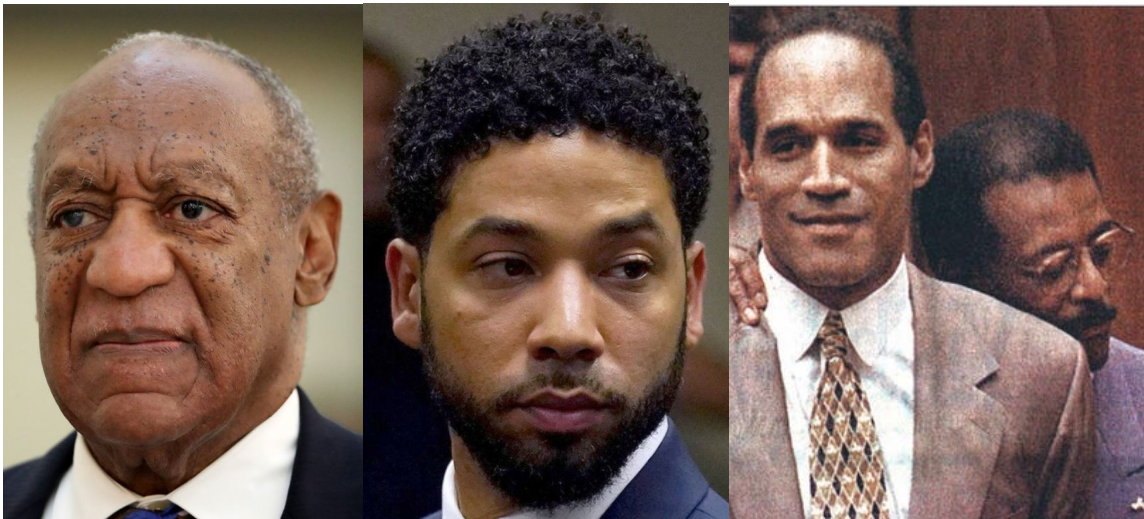
FREE AT LAST: A Rapist, a Pathological Liar, & a Murderer

Black Skin Privilege: Never being held legally accountable, and never having to say you're sorry, no matter what the crime.