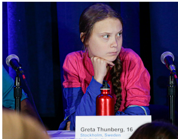
Climate " Expert " Greta Thunberg

Expert (noun): Someone who reliably advances the Corrupt Leftist Media's false narratives, such as " Man-made Global Warming ," the benefits of " multiculturalism ," or some particularly treasonous interpretation of the Constitution that would infuriate its Framers.