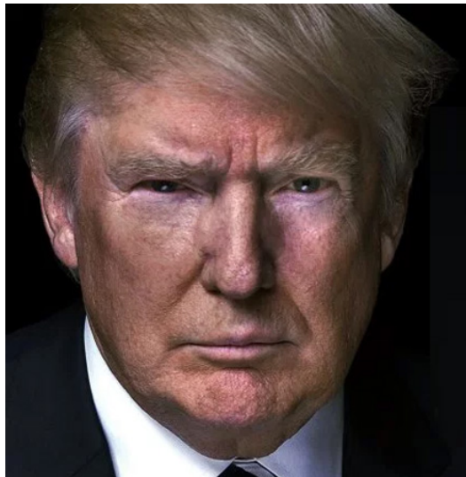
A Profile in Courage

These demographic groups were also attracted by the unique courage displayed by Trump as " Democrats " and their henchmen relentlessly and ruthlessly persecuted Trump based on fraudulent charges. I'm reminded of that line from Braveheart in which William Wallace (Mel Gibson) emphatically declares to Robert-the-Bruce , " Men don't follow titles, they follow courage. "