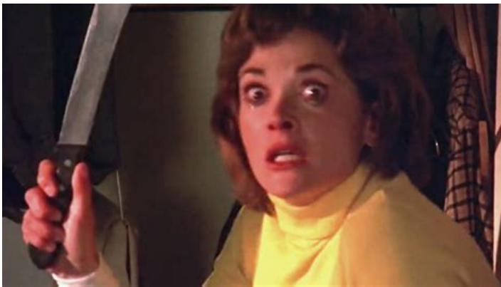
Actress from Play Misty for Me

The Psychiatric and Psycho-Analytic professions currently recognize several forms of a condition they call a " delusional psychosis. " One variety is referred to as Delusional Psychosis with Erotic Manifestations , evident in that crazy woman in the film Play Misty for Me , who made the life of Clint Eastwood's on-screen character a living nightmare. ( In real life, other scorned lovers made his life equally miserable. ) More recently, this was the obvious diagnosis of that woman who persisted in breaking into David Letterman's residence dozens of times -- despite restraining orders against her and multiple arrests -- because she was convinced that " God wanted us to be together. "