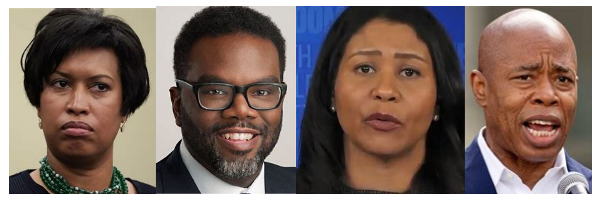
Bottom-of-the-Barrel: Washington, Chicago, San Francisco, New York

Blacks have also proved beyond any reasonable doubt that they are morally and intellectually INCAPABLE of self-government, because most are just too stupid, too childish, too ignorant, and too dishonest to govern intelligently. If black jury nullification, immunity for black "flashmobs," or the re-election of Fani Willis as Fulton County DA don't convince you, the abandonment of mostly-black areas by retailors should, which have created "retail deserts" in those areas. Blacks have presided over the rapid and irreversible disintegration of most large cities, and every white person with a brain is working to get as far away from their disasters as possible.