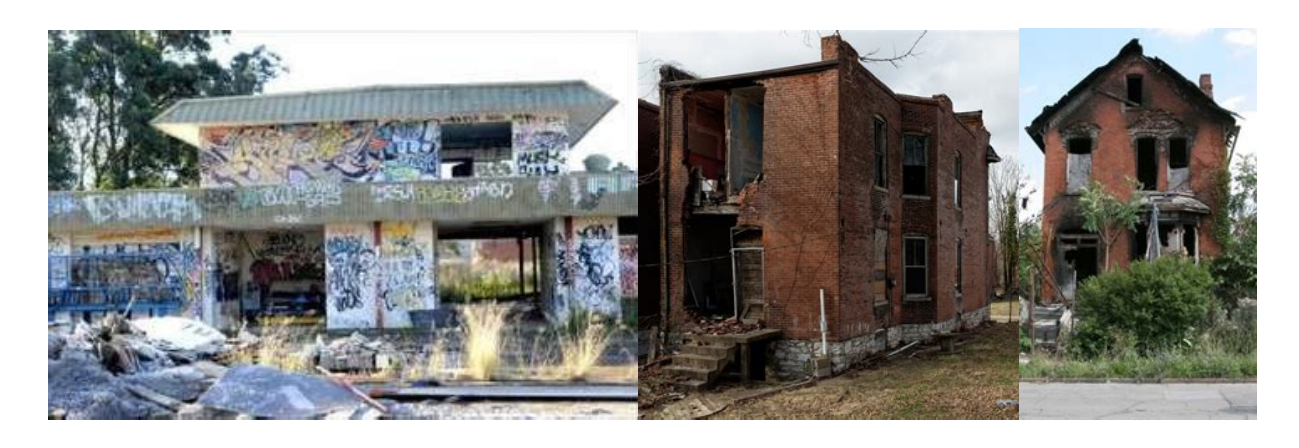
It Don't Takes 'Em Long...

Likewise, the forced desegregation of neighborhoods brought a black criminal element into direct contact with its white victims, rapidly turning safe and nearly crime-free neighborhoods into violent and dangerous cesspools. When the percentage of blacks in a given area reaches a critical mass around 20 percent, the writing is on the wall: what lies ahead are property crimes, violent crimes, burglary, voter fraud, declining property values, declining city services and corrupt and incompetent local government. Many black ghettos in the U.S. were once their city's most fashionable areas, but the lovely homes of city fathers in earlier times were long ago demolished to make room for public housing projects that now incubate Future Felons of America .