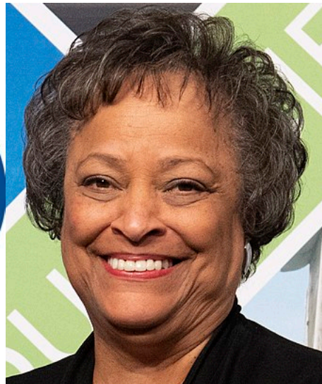
Heritage Foundation Logo and Former President

The role of federal welfare programs as a catalyst in this debacle is undeniable. One study in the 1980s claimed there were about 88 federal welfare programs available to most American families. Eligibility was usually based on income level, but some programs had no eligibility requirements whatsoever. Moreover, following " ObamaCare " the free stuff has increased dramatically. Unfortunately, as William Buckley pointed out in his 1974 book, Four Reforms, "Our experience with welfare has taught us that when you offer people free money, they have a strong inclination to accept it."