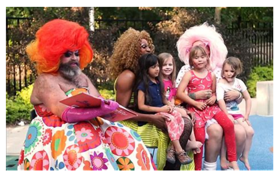
"Does everyone have their personal pronouns?"

Such ridiculous and subversive theories and practices are then adopted by traitorous teachers' unions -- such as the misnamed National Education Association , and the equally despicable American Federation of Teachers -- which are intent upon preparing a dumbed-down and ignorant America for the socialist world government they envision and promote.