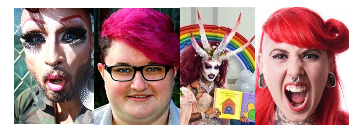
"The Gender Counselor Applicants are here for their interviews..."

Their aim is to appease the kinds of circus freaks who harassed and sued a Christian-owned bakery in an attempt to force its owners to bake wedding cakes for homosexual "marriages." This insanity has even caused some normal citizens to lose their jobs by accidentally choosing the wrong pronoun to describe some mentally-ill queer.