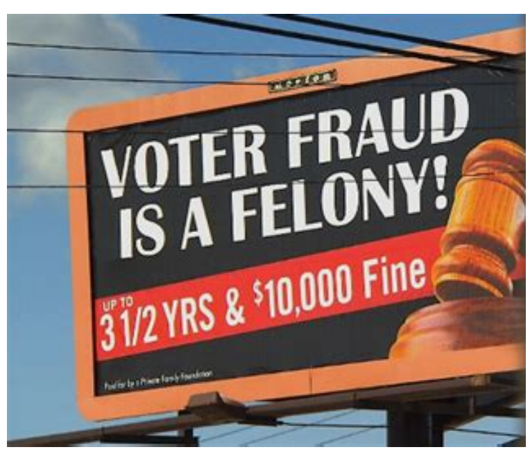
Provisions of the 1965 Voting Rights Act

One of many benefits resulting from decentralized ballot tabulation is that it would greatly complicate the NCPUSA's efforts to engage in large-scale vote fraud by effectively isolating that fraud and " quarantining " it at its points of origin. This reform would also make it much easier to investigate and audit evidence and allegations of voter fraud when ballots remain at the smaller and more easily manageable ward or precinct level. It would circumvent the formidable task and confusion of auditing the immense number of ballots that accumulate at a central tabulating facility . (For instance, that 2020 audit in Maricopa County involved over 2 million votes and took two months to complete.)