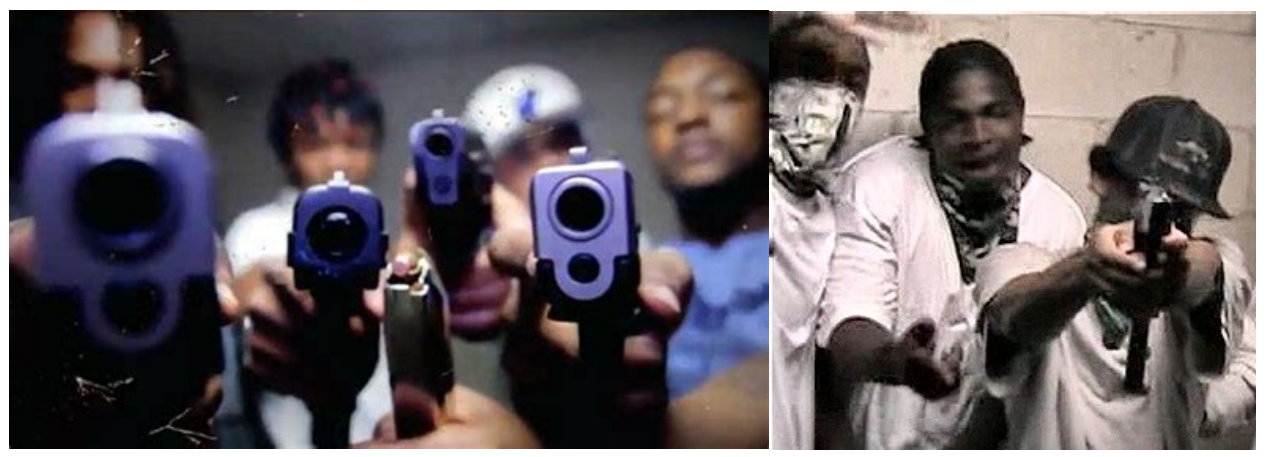
Nigs Doin' "They Thing"

The net result after 60 years is that blacks have become synonymous with violent crime, property crimes, welfare, illegitimacy, addiction and functional illiteracy. Despite that $35 Trillion the U.S. has spent on "Urban Welfare Spending" since the mid-1960s, the situation has consistently regressed. Today, blacks are significantly angrier, more violent, more dependent on welfare, more likely to be illegitimate, more likely to be involved with drugs, and far more likely to have been incarcerated in one of our state prison systems than 60 years ago.