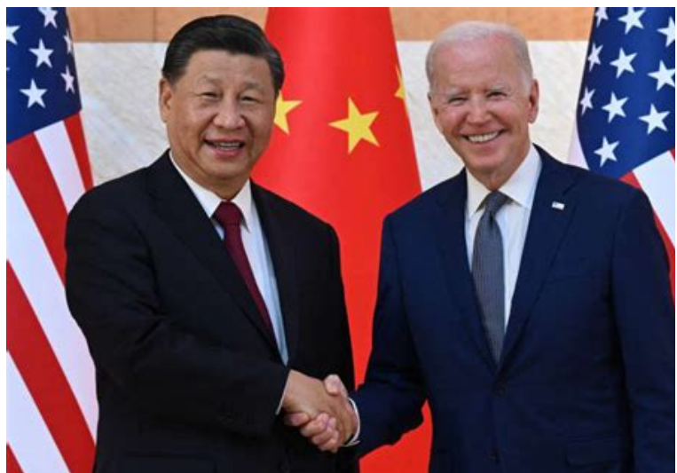
Disarming Crocodile Smile of Xi Jinping