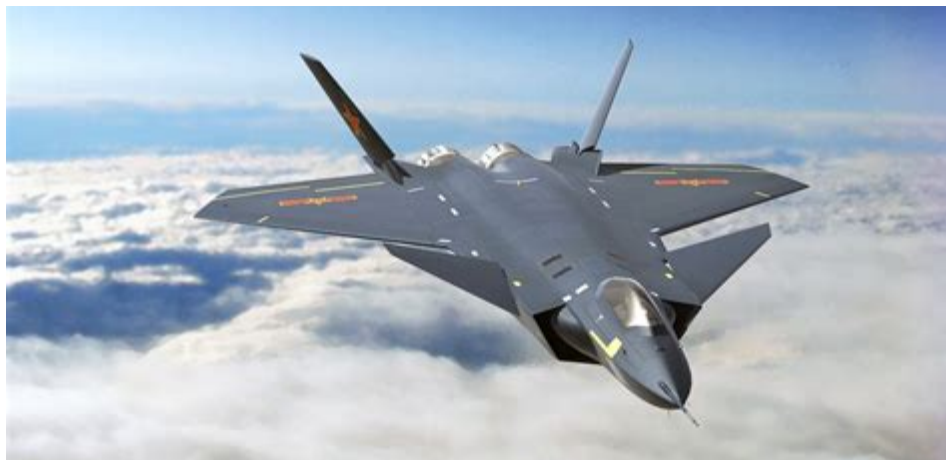
China's J-20 Stealth Fighter