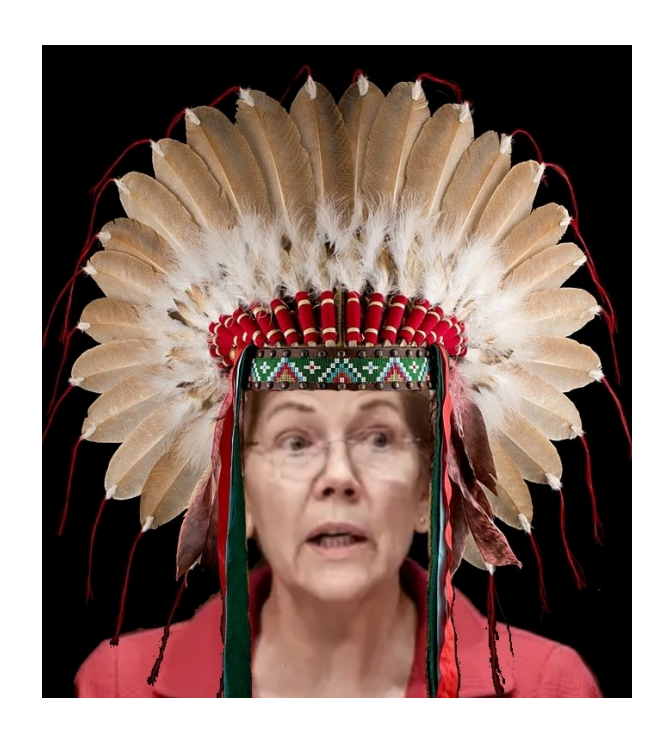
Pocahontas with War-Bonnet

A similar example of leftists empowering the deranged involved threats by Obama's "Justice" Department against the state of North Carolina in 2016 over one of its state statutes. North Carolina enacted a law requiring those mentally-ill individuals who call themselves "transgendered" to use public restrooms based on to their BIOLOGICAL gender rather than their self-identified gender. Of course, Obama's DOJ was merely recruiting potential supporters by empowering these sad and unstable perverts to run amuck in girl's restrooms and locker rooms.