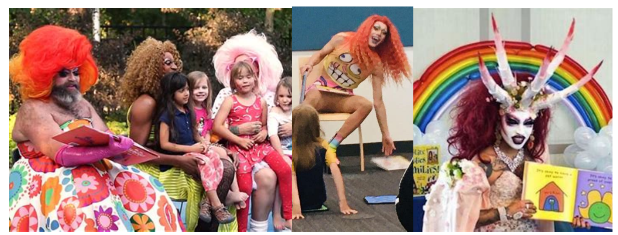
"Drag Queen Events": Queers Grooming Kids in Plain Sight

Queers are NOT like everyone else, because no one else defines themselves on the basis of their aberrant sex acts.