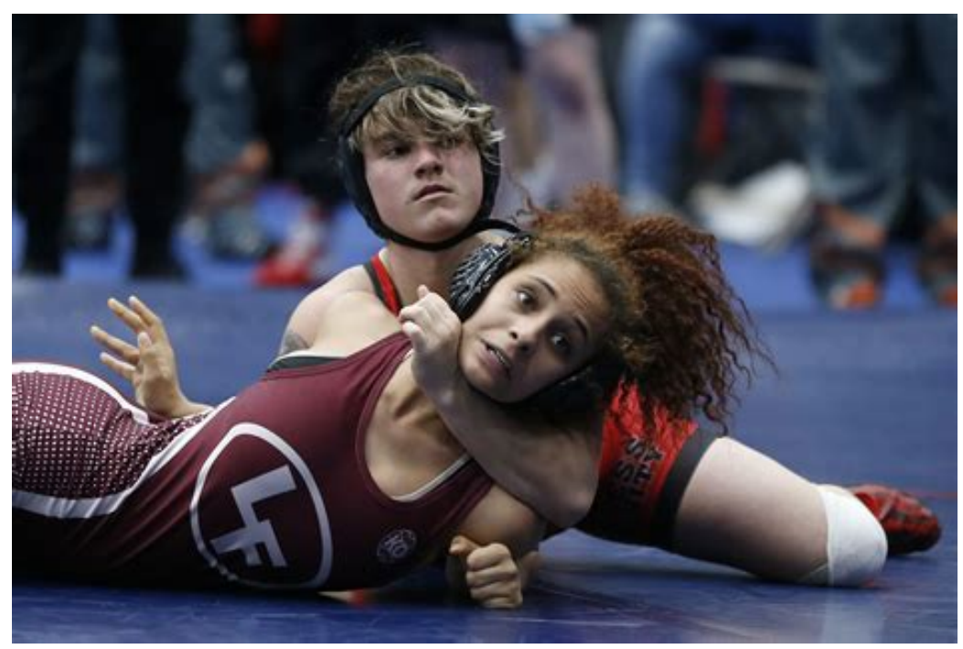
"Trans" Wrestler Defeats Girl In TX State Final

school systems are primarily interested in pursuing an ideological agenda rather than the wellbeing of students, and are NOT better suited than parents to determine the best interests of their children.