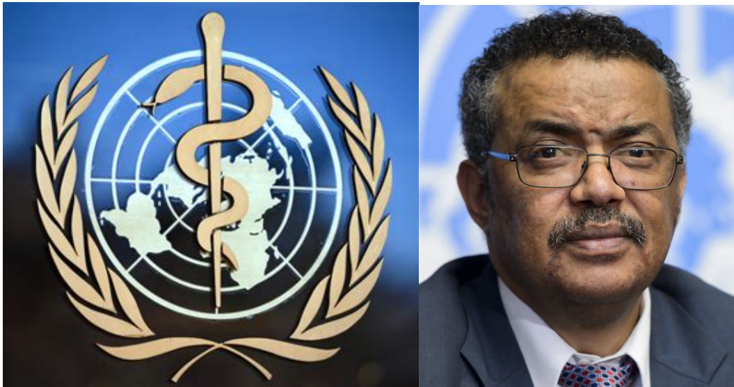
WHO Logo & Its Chinese Stooge Director

repeatedly lied to the world about the ChinaVirus -- to define what an " international public health emergency " is, and override U.S. laws and the Constitution in order to deal with such an event. By the way, the WHO considers "climate change" and Third World poverty to be "international public health emergencies."