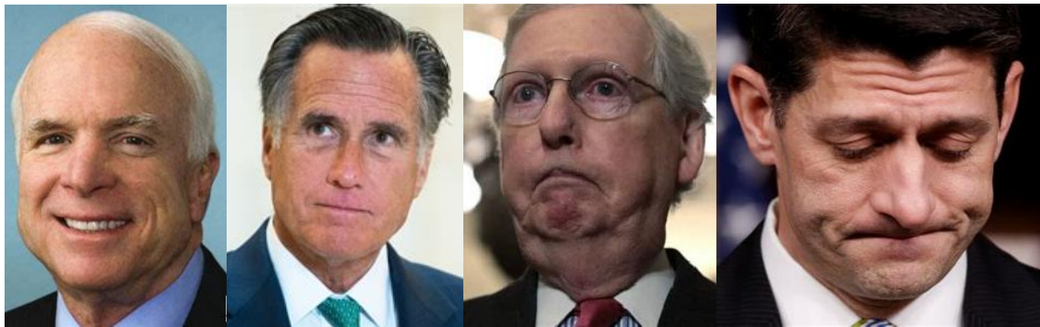
RINO Whores for the Donor Class

That's also why -- in truly Machiavellian fashion -- the donor class has often used its power and influence to ensure that the GOP is led by mediocrities or traitors who stifle the adoption of conservative reform initiatives that should have become law decades ago. Recent examples would be the timid presidential campaigns of Mitt Romney and John McCain, and the elevation of such devious traitors as Mitch McConnell to Senate Majority Leader , and John Boehner and Paul Ryan to Speaker of the House . House Minority Leader Kevin McCarthy was hardly better.