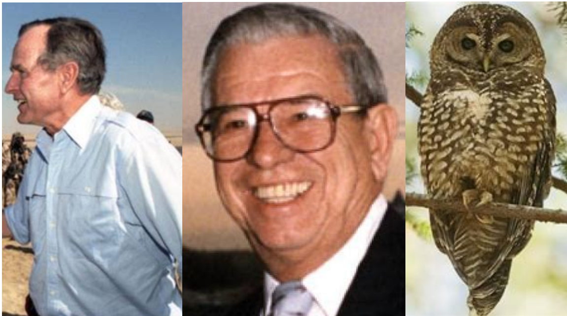
3 Bird-Brains: Bush Sr., Manuel Lujan & Spotted Owl

Yet, it was Bush's OWN Interior Secretary, Manuel Lujan, who declared the Spotted Owl an endangered species, thus killing the logging industry's harvesting of old-growth forests in the American Northwest, and forcing the home-building industry to import Canadian (" CanFor ") lumber Bush probably never even knew it.