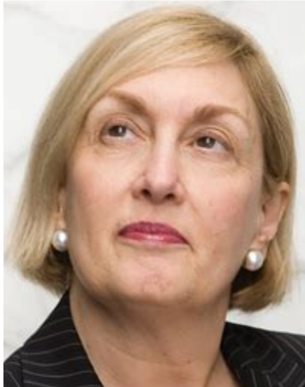
Jewish Architect of 9-11

clearly done to shield the Clinton Administration from any repercussions from having admitted terrorists posing as immigrants, who might eventually embarrass the administration and NCPUSA with terrorist acts. The consequences of the Gorelick Memo were the events of September 11, 2001.