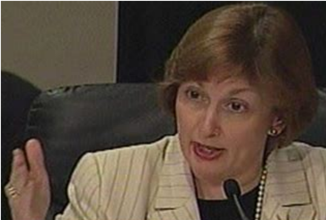
September 11 Commission Member Gorelick

communists who spied for the USSR during Franklin Roosevelt's Administration had done in the 1940s -- Jamie Gorelick was appointed to serve as a COMMISSIONER on the National Commission on Terrorist Attacks Upon the United States , or the " 9-11 Commission " that issued the official report of that disaster. We have former Attorney General John Ashcroft to thank for calling her out by name in his testimony before the 9-11 Commission , and exposing the Gorelick Memo to those who cared to listen. Were it not for Ashcroft's testimony, the public might never have heard of the Gorelick Memo .