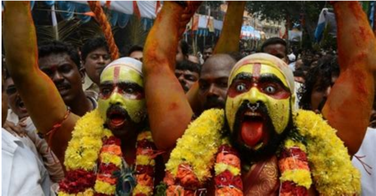
California Joint Committee on the Environment

largely responsible for its outrageously expensive electricity rates, and the profound shortages of power causing those “rolling blackouts.”