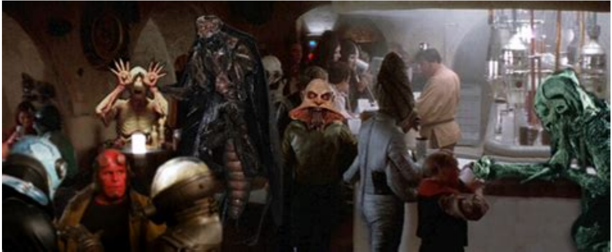
California State Assembly, in Session

For example, California appears hell-bent on transferring wealth to blacks who have never been slaves, using funds provided primarily by white people who never owned slaves. A California Reparations Task Force was appointed in 2020 by California's reptilian Governor, Gavin Newsome, who endorsed this insane idea out of sheer cowardice. Apparently, no one on the Task Force had enough brains to multiply 2.2 million black beneficiaries by the $360,000 amount proposed per nigra, a total of $792 Billion or more than 20 percent of the retail value of California's entire economy in 2023.