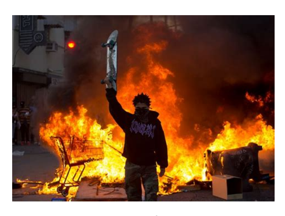
BLM & Antifa Riots

Finally, the Antifa and BLM riots of 2020 were carefully staged to take place in large cities controlled by " Democrats ." There, political authorities could safely order police to " stand down ," even as rioters engaged in arson, murder and aggravated assault against innocent civilians and law enforcement. It was part of their conspiracy that rioters would NOT experience arrest and prosecution, so there would never be any legal consequences for their violent and criminal acts. Many were even rewarded by receiving tens of thousands of dollars apiece from New York, Seattle, and Philadelphia for the " indignity " of being arrested while rioting.