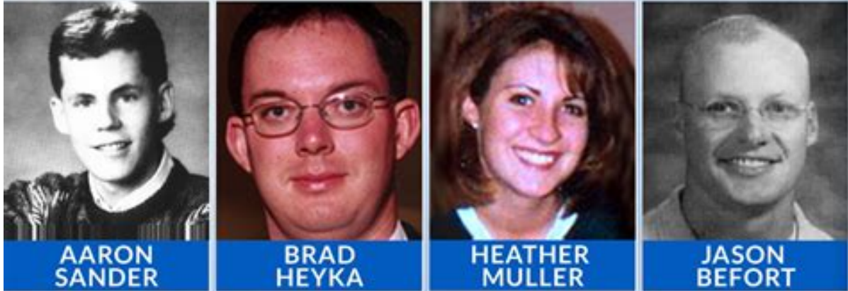
Murder Victims of Wichita Massacre