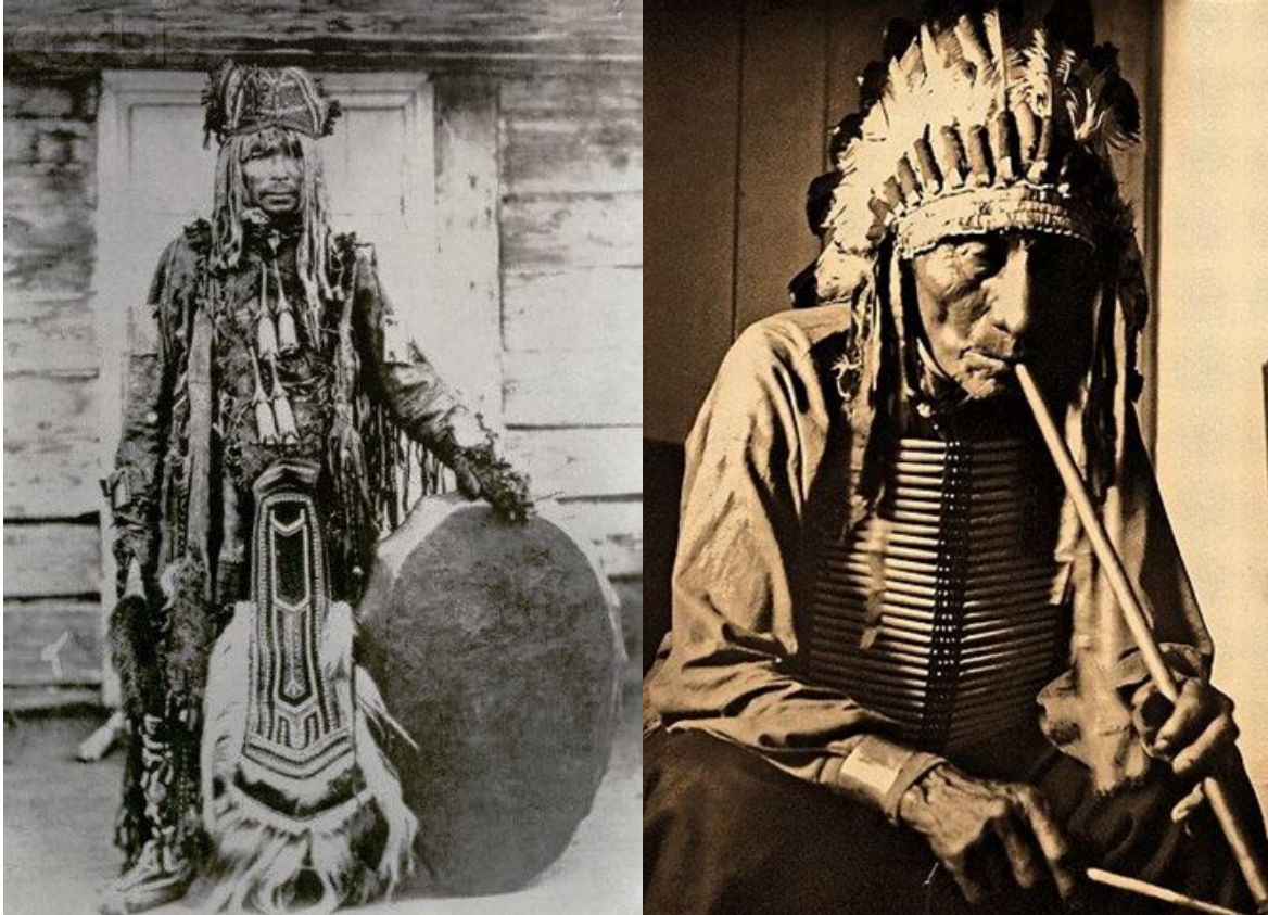
Indian (" Native American ") Medicine Men

Have you ever seen a witch-doc cure a deadly disease, or watch him land a spacecraft on the Moon? As for those stone tools you esteem so highly: such tools are often used by a baboon.