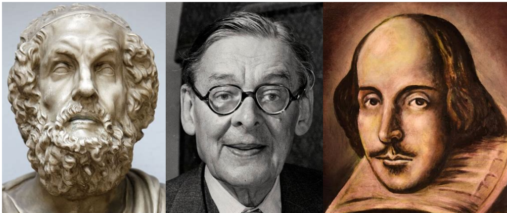
Homer, Eliot and Shakespeare

Hieroglyphics leave a lot to be desired and Oral Tradition clearly has its place: But give me Homer, Elliott and Shakespeare, Literature undreamt of by your race.