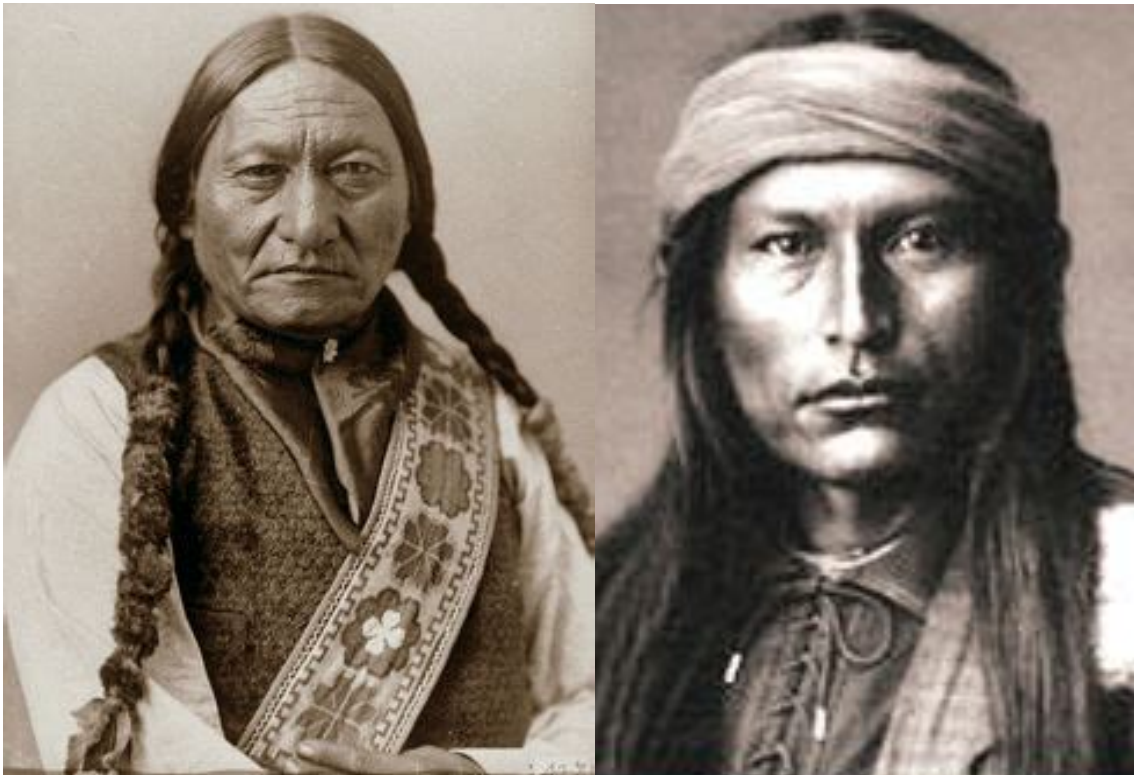
Sitting Bull & Cochise

It wasn't Sitting Bull who split the atom and Cochise never gave you Rule of Law ; Your lack of wheel or even written language, Would seem to Western Man a fatal flaw.