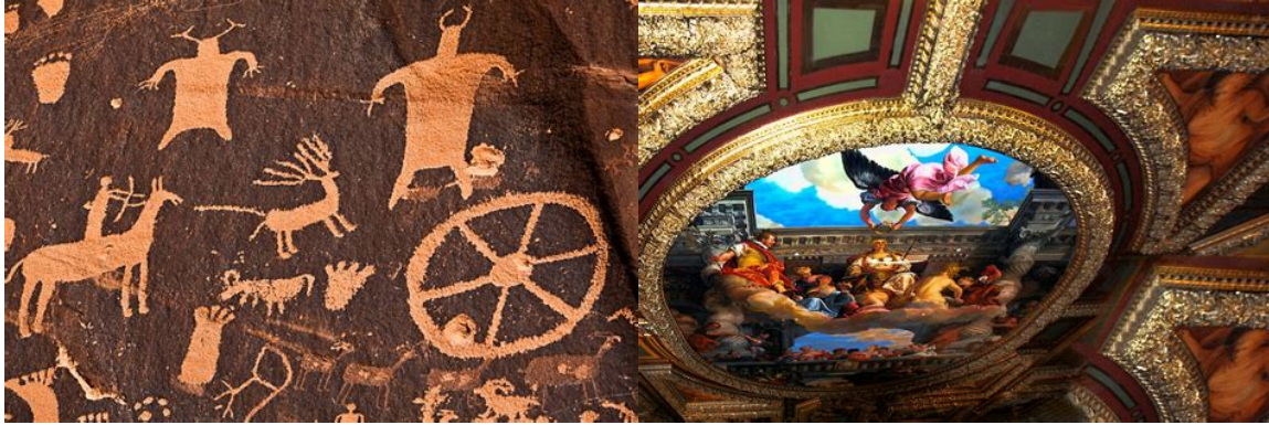
Indian ("Native American") Petroglyphs & Sistine Chapel

Hieroglyphics leave a lot to be desired and Oral Tradition clearly has its place: But give me Homer, Elliott and Shakespeare, Literature undreamt of by your race.