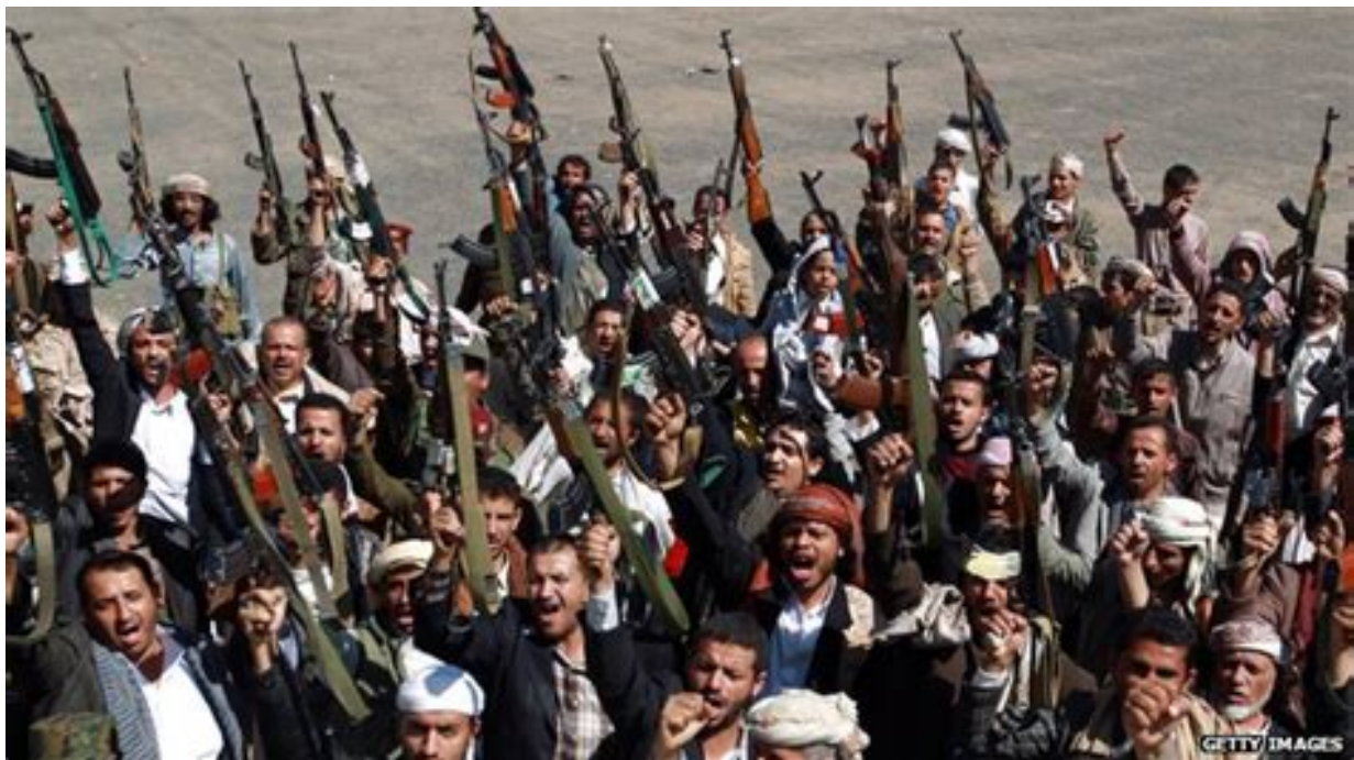
Houthi Rebels: Prime Candidates for a Nuke

Moreover, the Biden Administration has mindlessly attempted to renew the Iran Treaty , first entered into during the Obama regime and possibly the worst ever negotiated by America or any nation. With the same academic naivete that Carter's negotiators demonstrated, Biden's team has attempted to revive a treaty that gives Iran carte blanche to build a nuclear weapon. In fact, Biden's chief negotiator proved to be an Iranian sympathizer and mole! Biden also freed more than $100 Billion in Iranian oil revenues from the international banking community's Swift System , which allowed Iran to continue funding Islamic terrorism around the globe. This helped fund and equip Hamas, the terrorist force that invaded Israel on October of 2023 and brutally murdered 1,200 innocent civilians of all ages and genders. Iran also funds the Houthi rebels, who routinely attack commercial shipping in the Red Sea.