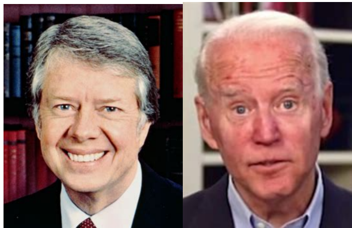
Jimmy Carter and Joe Biden

Today, the "Democrat" Party controls the White House, the Senate, and the House, intermittently. During the Carter Administration from 1977 to 1980, they controlled the White House and both Houses of Congress. Moreover, The "deep state" is its creation. The common denominators between these two "Democrat" Administrations is their weakness, incompetence, and vacillation , which precipitated the failed presidencies of both. The one big difference is that for all his faults, Jimmy Carter did not hate America, nor wish to exploit it for personal gain.