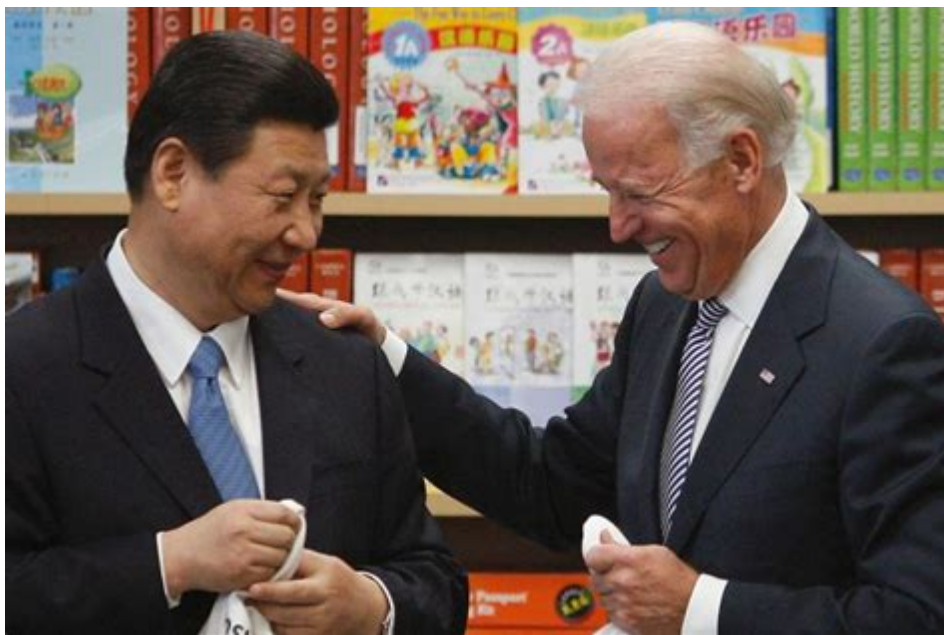
Best Friends Forever

After decades of China spying with impunity on America -- through scientific, trade, diplomatic, and educational exchanges -- in 2019 President Trump established the " China Initiative " to counter-surveil its legions of spies operating in the U.S. China targets state-of-the-art weapons systems, cutting-edge research at our universities, the fake news industry, and witless politicians like Eric Swalwell (D-Beijing.) China's 400,000 students matriculating at American universities and its 100 Confucius Institutes must assist China's intelligence services if called upon. However, the Biden Administration CANCELLED THE CHINA INITIATIVE in February of 2022, with the laughable explanation that the program contributed to " racial profiling. "