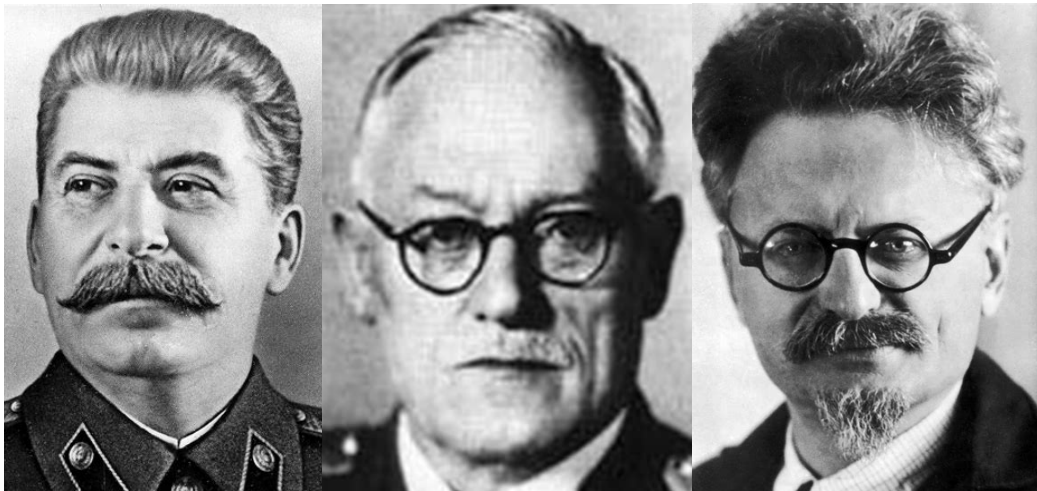
J-6 Committee's Inspiration: Stalin, Vyshinsky & Trotsky

Likewise, the NCPUSA's January 6 Committee was a kangaroo court capriciously selected by Nancy Pelosi (D- Gambino ), consisting of two cherry-picked RINOs who hated Trump, with the balance of the committee consisting of vicious Jewish liars and House-n*ggers from the NCPUSA. This so-called J-6 Committee withheld exculpatory evidence and destroyed exonerating evidence , and behaved exactly as Andrey Vyshinsky did while serving Stalin as judge and prosecutor during the Moscow Show Trials . The J-6 Committee's sole purpose was to eliminate Biden's chief rival, Donald J. Trump, just as Vyshinsky was tasked with eliminating Stalin's chief rivals, such as Leon Trotsky and his Menshevik followers.