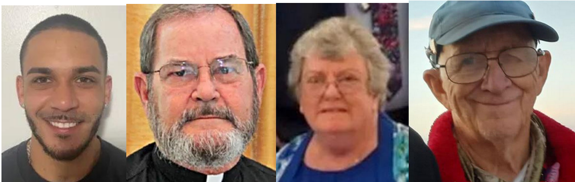
Murderous Ape & Three White Victims