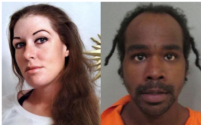
Victim & Murderer