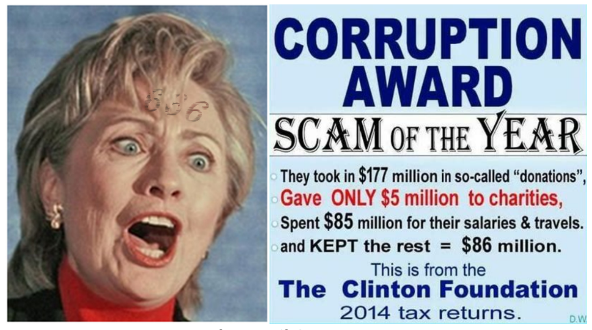
The Devil & Her Due