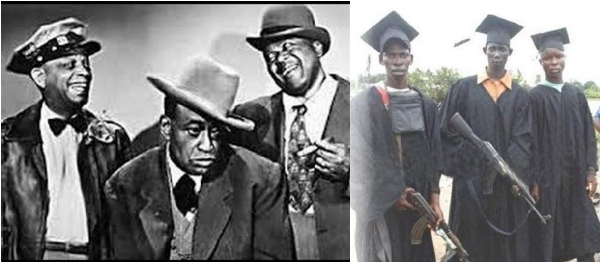
"We Sho' 'Nuff Bees Teechers"

court-ordered school desegregation as a "remedy." Yet, the only thing school desegregation accomplished was to hand over inner city public school systems to corrupt and incompetent blacks, who are no more capable of educating than they are of performing brain-surgery.