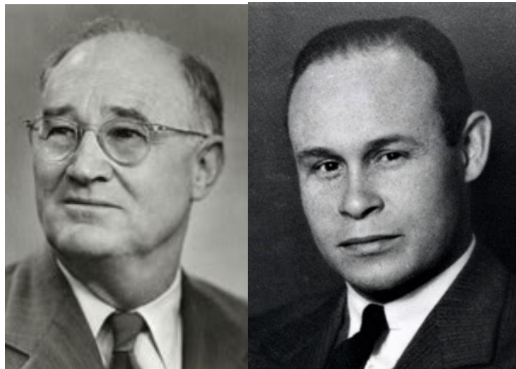
Dr. Oswald Robertson and Dr. Charles Drew

By the mid-1930s, Russian medical professionals had established a national system for collecting, typing, and storing blood. Another white man, Dr. Bernard Fantus copied the Russian system by establishing the first American blood bank at Chicago's Cook County Hospital in 1937. It was Fantus who coined the term " blood bank ."