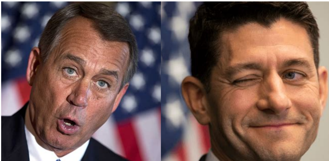
John Boehner (R-Golfer)

That's also why -- in truly Machiavellian fashion -- the Donor Class has repeatedly used its power and influence to ensure that the GOP is led by mediocrities who muzzle our conservative enthusiasms and stifle conservative reforms that SHOULD have become law decades ago. Obvious examples would be the elevation of a mediocrity like John Boehner or a devious traitor like Paul Ryan to Speaker of the House . That's also why it forced out Newt Gingrich from Speaker in 1999, only five years after he personally orchestrated the first House Republican Majority since 1952, and gave us three years of balanced federal budgets.