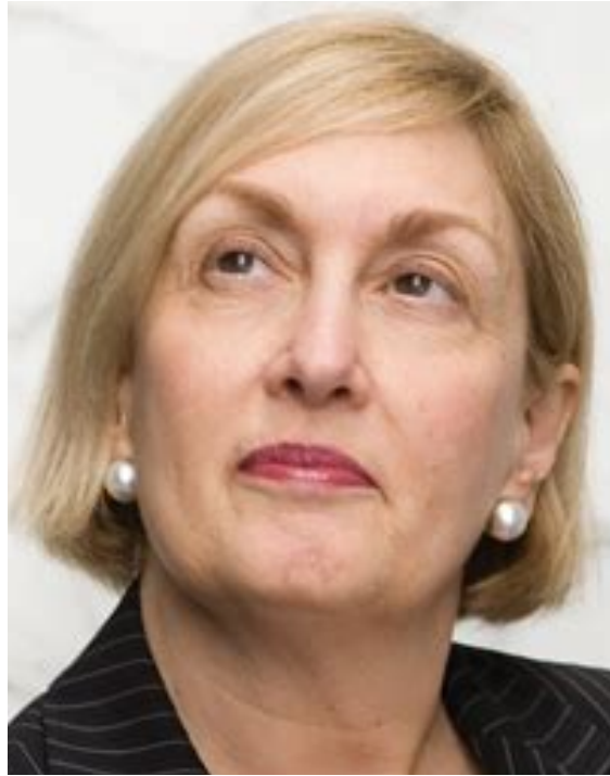
Jewish Architect of 9-11

done to shield the Clinton Administration from any repercussions from having admitted terrorists posing as immigrants, who might eventually embarrass the administration and NCPUSA with terrorist acts.