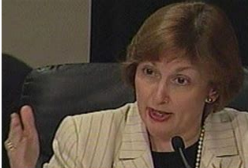
September 11 Commission Member Gorelick

Proving also that the NCPUSA learns nothing from the disasters it generates, the current NCPUSA administration under Joe Biden has welcomed a tsunami of illegal immigration into the United States. Many illegal immigrants are likely terrorists who found it easier to steal across our southern border than apply for a visa. No one in Washington seems to recognize that if you don't welcome terrorists in the first place, it's much easier to avoid acts of terrorism.