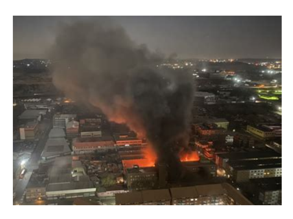
Johannesburg's CBD Aflame

When apartheid ended in 1994 and South African whites foolishly granted full citizenship to a mentally and morally deficient race, an enormous fire broke out in Johannesburg's Central Business District (CBD) that killed at least 70 people. Its cause was probably arson , because it originated at 80 Albert Street -- office of the Non-European Affairs Department -- where blacks were required to apply for temporary passports during apartheid when their travel was restricted.