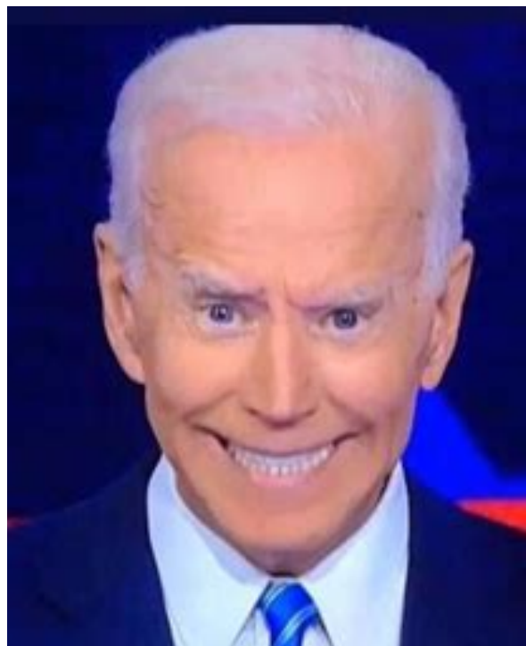
"The Big Guy"

For those concerned about the damage a Harris Presidency would certainly bring, consider this: how could Kommie Harris be any more destructive of America than Joe Biden has been?