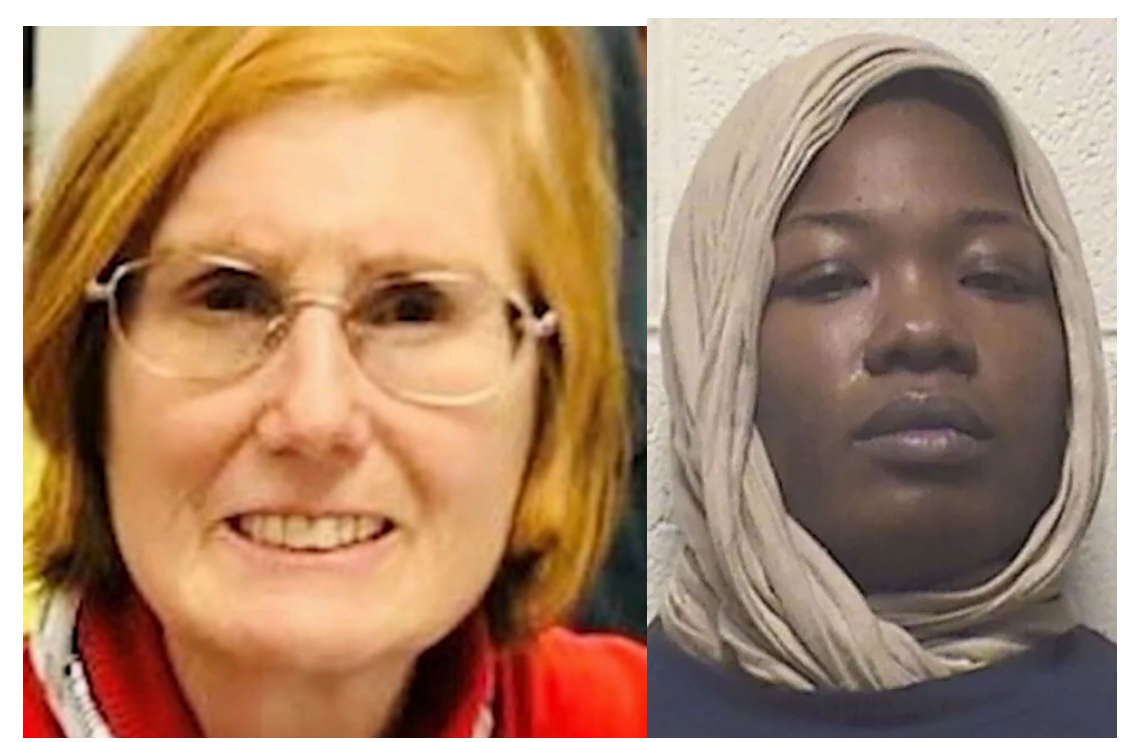
Innocent Victim & Savage Ape

parts in her freezer. The baboon apparently ignored its natural instincts, and refrained from eating its victim.