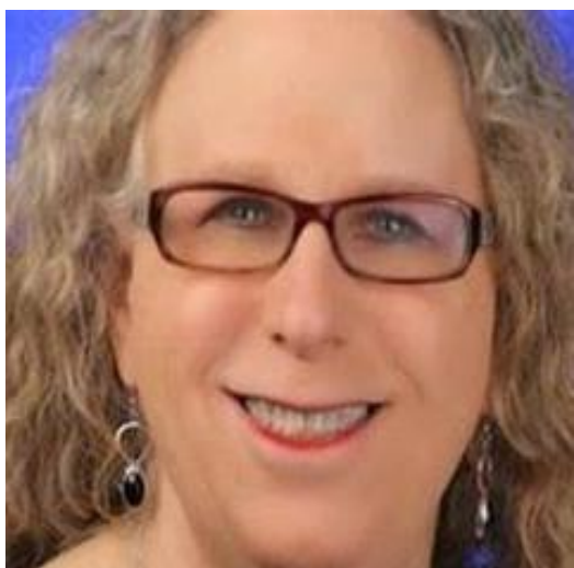
America's first Four-Star Admiral to wear both women's panties and after-shave.