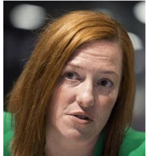
Unable to utter the truth, even if it would save her soul.