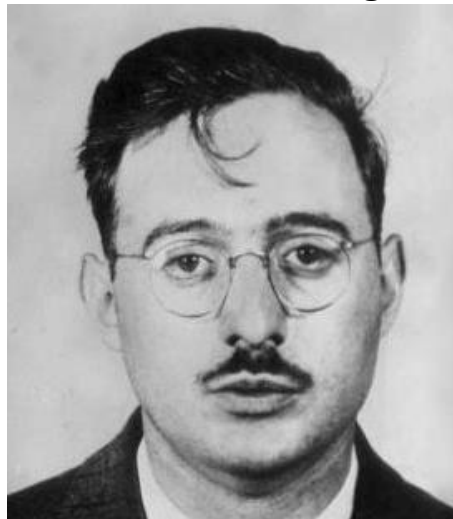
Transferred atom bomb secrets to the Soviets during W.W.II.