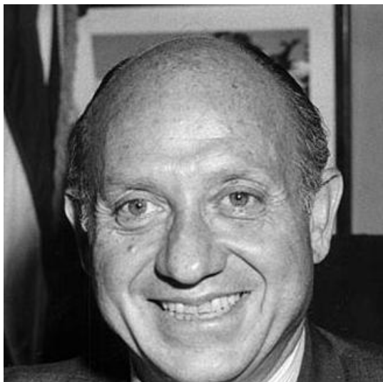
Architect of our immigration disaster.