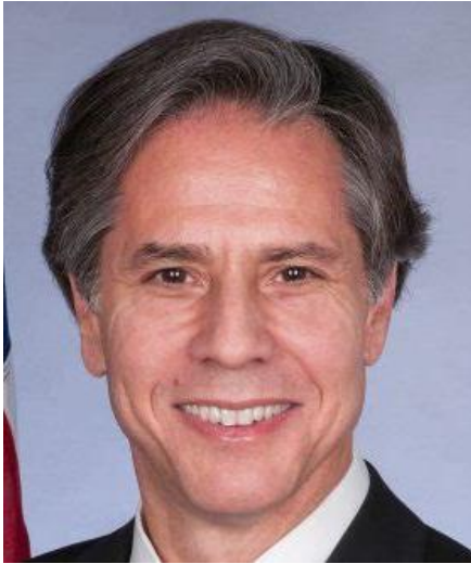
Architect of Biden's catastrophic foreign policies.