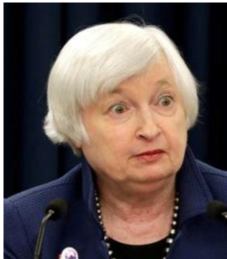
Gave us double-digit inflation as Fed Chair and as Treasury Sec.