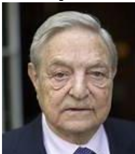
Billionaire who loves money but hates democratic capitalism.