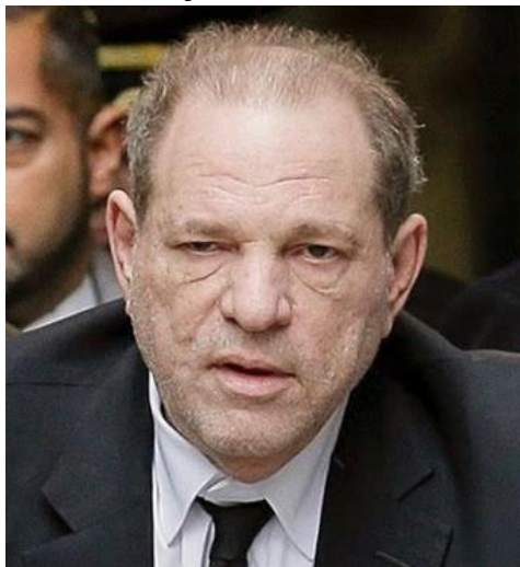
Sexual predator with Dorian Gray look.