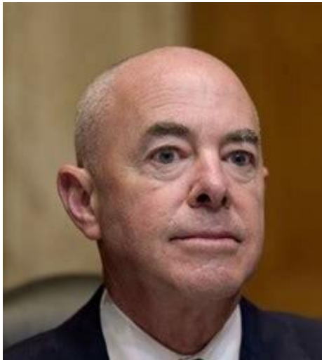
"The border is secure"