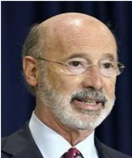
Violated PA State Law by allowing voter fraud.