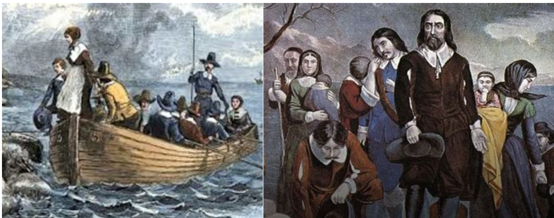
Religious Refugees Seeking Freedom in North America

The Protestant Reformation and religious wars in Europe prompted a variety of religious refugees to immigrate to North America and become its earliest colonists. Pilgrims, Puritans, Anglicans, Catholics German Lutherans, French Huguenots, Quakers and other denominations fled religious persecution in their nations of origin, and sought sanctuary in the original 13 Colonies.