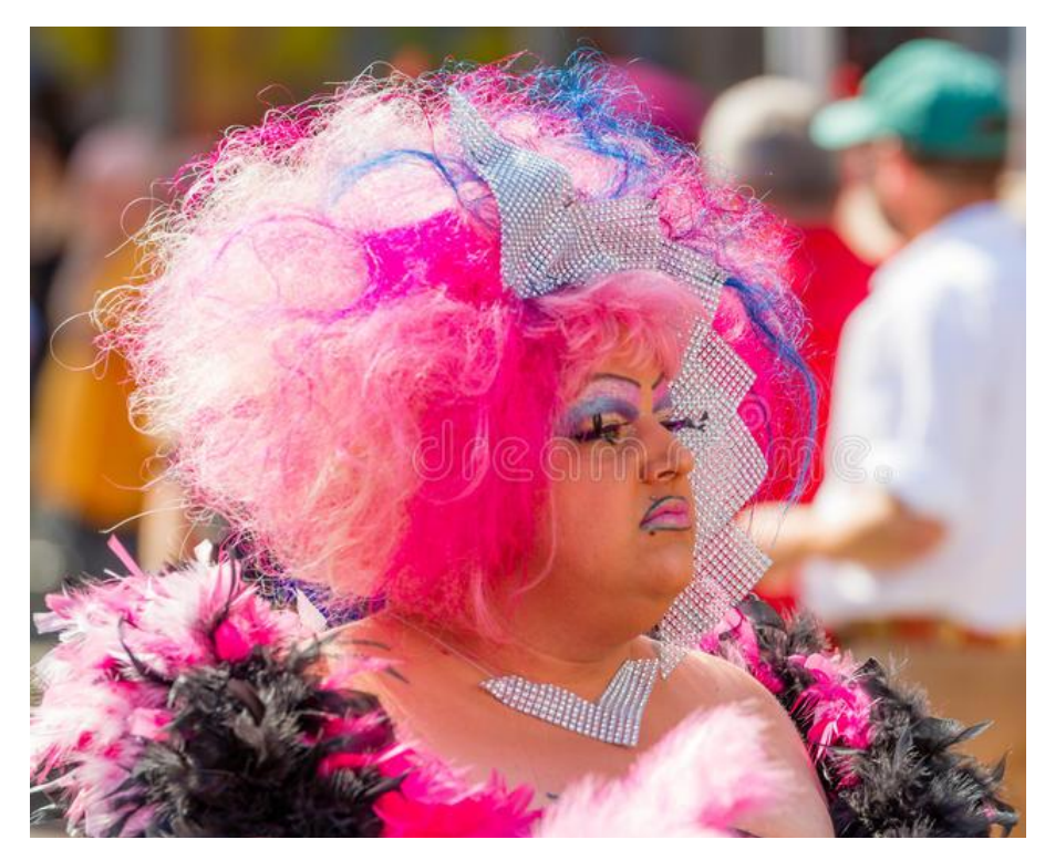
Grade School Gender Counselor ???

buyer's remorse. Many feel they were wrongly pressured into undergoing such dubious medical procedures, and feel their lives have been ruined as a result.