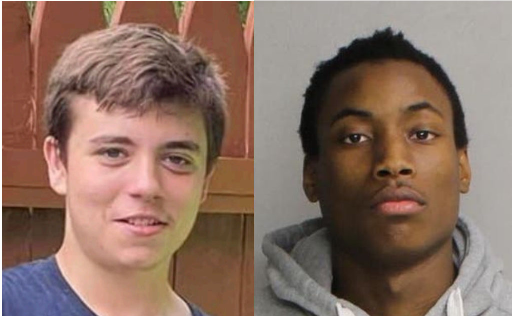
Foolish White Kid

The nigroid murderer has been charged with two counts of first-degree murder for this offense, and has eight outstanding warrants from neighboring municipalities for terroristic threats, robbery, and aggravated assault. (Isn't diversity grand ?)