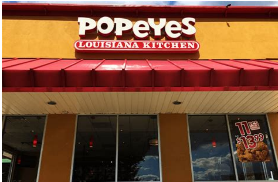
Popeye's Chicken Restaurant

For example, a recent article in the CITIZENS INFORMER analyzed a laughable study that blamed Philadelphia's raging gun violence on broken windows, uncut weeds, and litter. (E. Holt. "Endless Enabling," March, 2023.) Black violence has also been blamed on "white privilege," the Second Amendment, and not having enough playgrounds. But recently, the nigro mayor of Baltimore may have lowered the bar even further by blaming Popeye's chicken for a recent mass shooting.