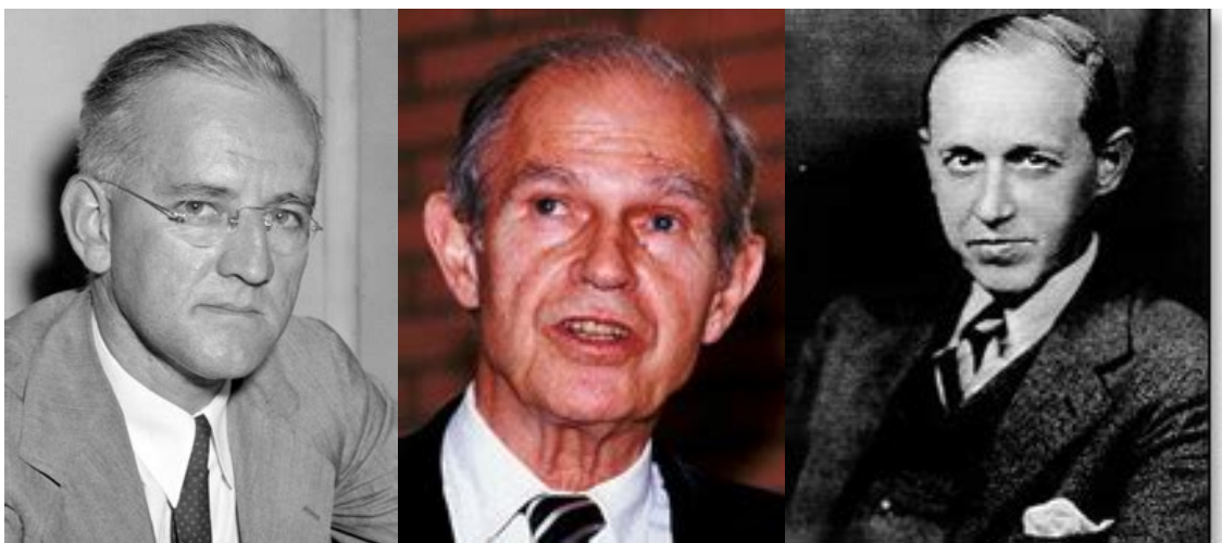
Lauchlin Currie ( Page ,) Alger Hiss ( Mars ) and Harry Hopkins ( Agent 19 )

Hiss had been independently recruited by both the NKVD (Soviet code-name " Lawyer ," ) and by Soviet Military Intelligence, or the GRU (code-name " Mars ." )