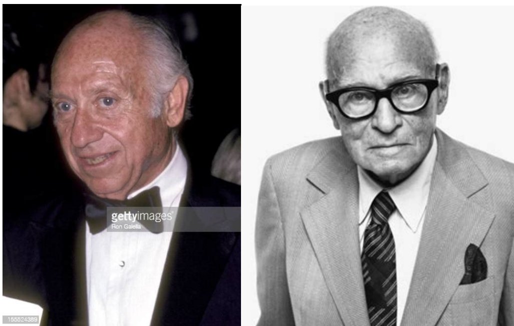
Jacob Javits & Emanuel Celler

The first tangible impetus for " deconstructing " the racial composition of majority-white America began with a Jewish Congressman (eventually Senator) from New York named Jacob Javits. In a 1951 editorial in the NEW YORK TIMES entitled " Let's Open The Gates, " Javits proposed immigration levels of 500,000 a year for 20 years with total disregard for national origin or ethnicity.