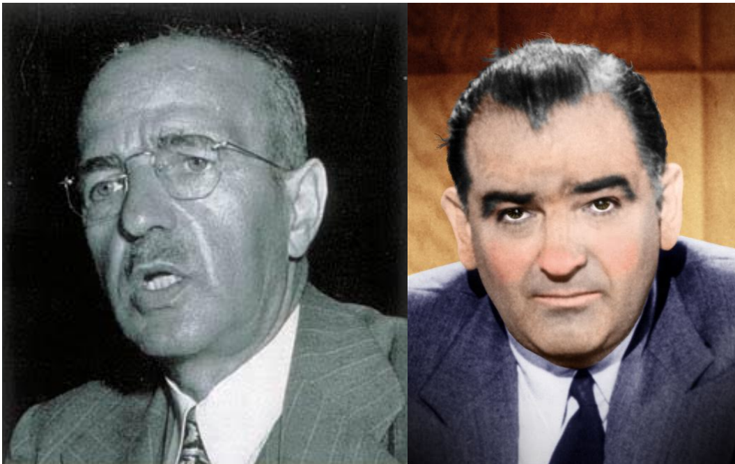
Soviet Spy Harry Dexter White & Heroic Sen. Joseph McCarthy